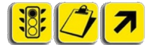
WAREHOUSING & DISTRIBUTION