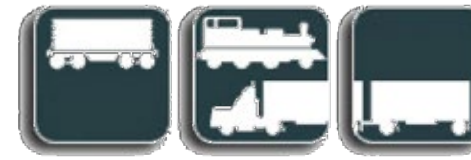
ROAD & RAIL TRANSPORTATION