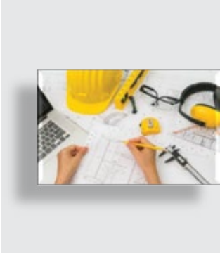
ENGINEERIN & MANUFACTURNG