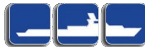
OCEAN FREIGHT SERVICE