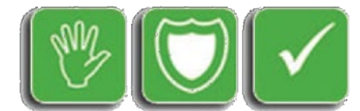
CUSTOMS CLEARANCE (CHB)