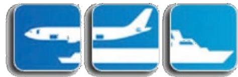
SEA/AIR COMBINED TRANSPORT