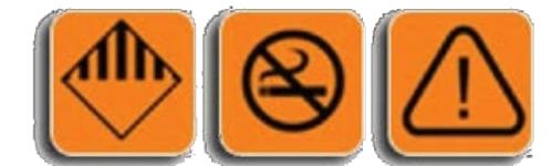
DG CARGO HANDLING