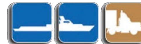
AFGHAN TRANSIT TRADE