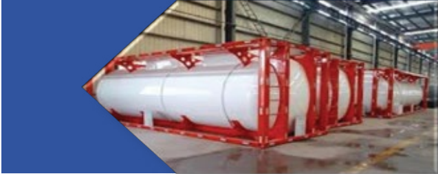
BULK LIQUID CONTANER