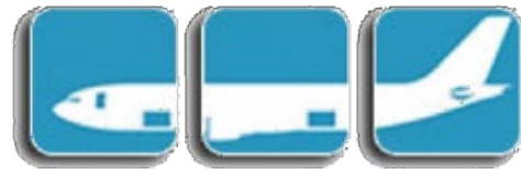
AIR FREIGHT SERVICE