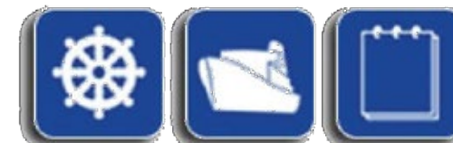
SHIP HANDLING, CHARTER & LINE AGENCY